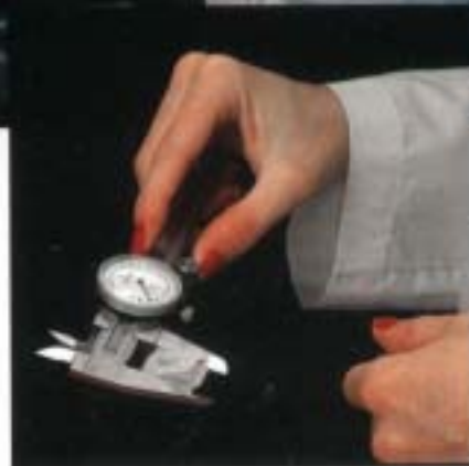
INJECTION MOLDED THERMOPLASTICS